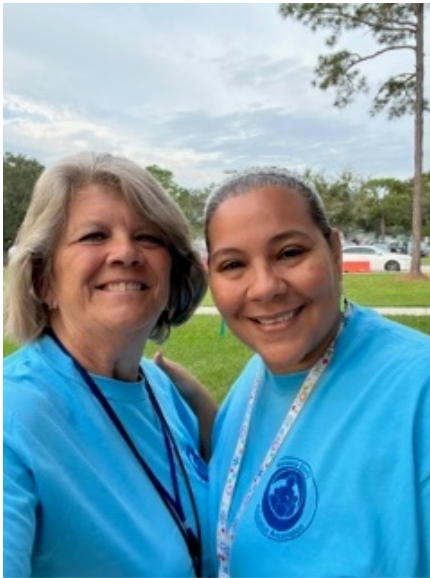
Boggy Creek has OCEA pride!