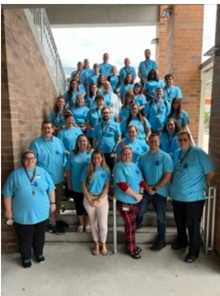
Tohopekaliga High School is union strong!

OCEA is currently on the second round of school visits beginning with the schools in Poinciana and working north and east in the county. If there is a particular day you would like a visit, contact the office to be placed on the schedule.